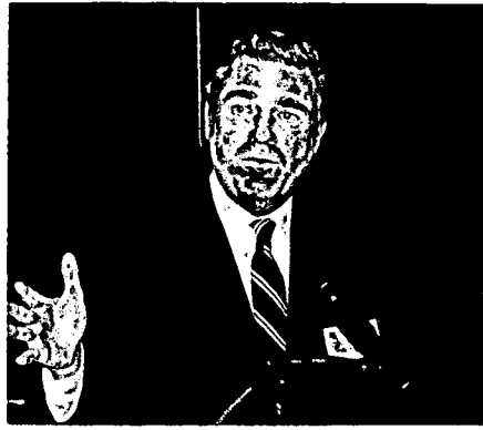
U.S. Congressman Matthew McHugh, keynote speaker for the 1990 UDC Awards Banquet.