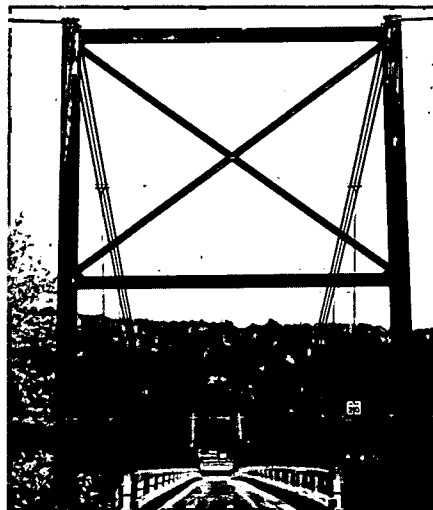
The Kellams-Stalker Bridge.

and the bridge was then reopened to traffic. In the second phase, major repairs were performed. The New York