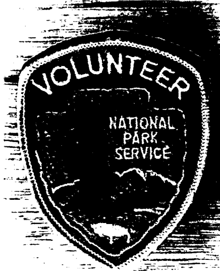
VIP patch for parks volunteers.

employees also participate in the VIP program by volunteering their off-duty time to perform tasks such as river cleanups and hosting special events.