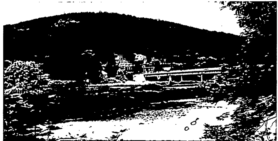
Callicoon, New York, in the Town of Delaware. A UDC technical assistance grant helped the town save $1 million. See story on page 4.

This brings the number of voting members of the Upper Delaware Council to 13 out of a possible 17. All eight New York towns, the Pennsylvania Townships of Lackawaxen, Shohola, and Westfall, and the State of New York and Pennsylvania are now voting members. Only the Wayne County Townships of Berlin, Buckingham, Damascus, and